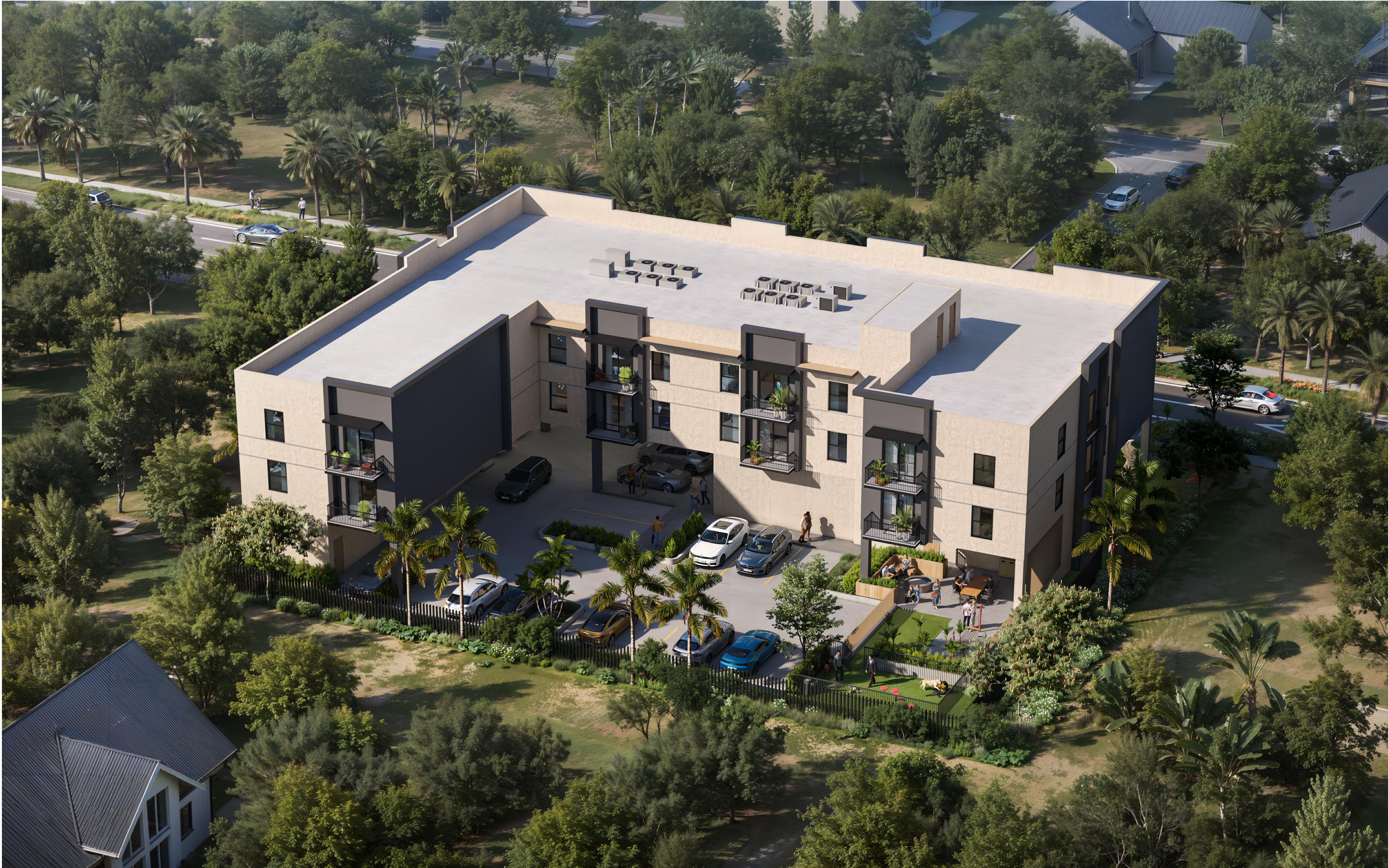
3D RENDERING - SOUTHEAST CORNER AERIAL VIEW